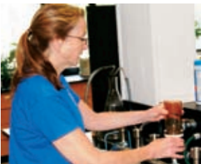
Lab Tech performing a water quality analysis

We encourage you to take the time to read this report to learn more about the quality of your drinking water. Water treated and distributed by Anne Arundel County is continually monitored for quality by the County's state certified laboratory, the State and private laboratories.