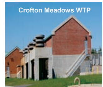
Crofton Meadows WTP

During 2010, significant progress was made on two major construction projects, both of which involve the production capacity of water treatment plants. Work was completed on the project to increase the Crofton Meadows Water Treatment Plant (WTP) capacity from 5 to 15 mgd (million gallons per day). Significant progress was made on a similar project at the Arnold WTP. The capacity of that facility is increasing from 8 to 16 mgd. The completion of this project in mid 2011 will greatly enhance the County's ability to produce a greater percentage of the drinking water supplied to our customers. Other ongoing projects include new or replacement wells, the cleaning and lining of existing distribution pipes, rehabilitation of water services, fire hydrants, and other components of the water distribution system.