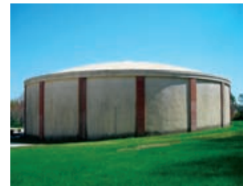
Ground Storage Tank