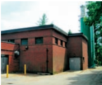
Severdale Water Treatment Plant