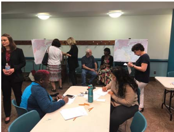
Citizens review the Community Boundary map and complete surveys