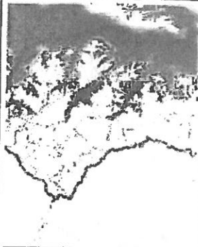
EXHIBIT B Map SP-200A Abandoned Well Site #1 Harmony Avenue, Arnold MD