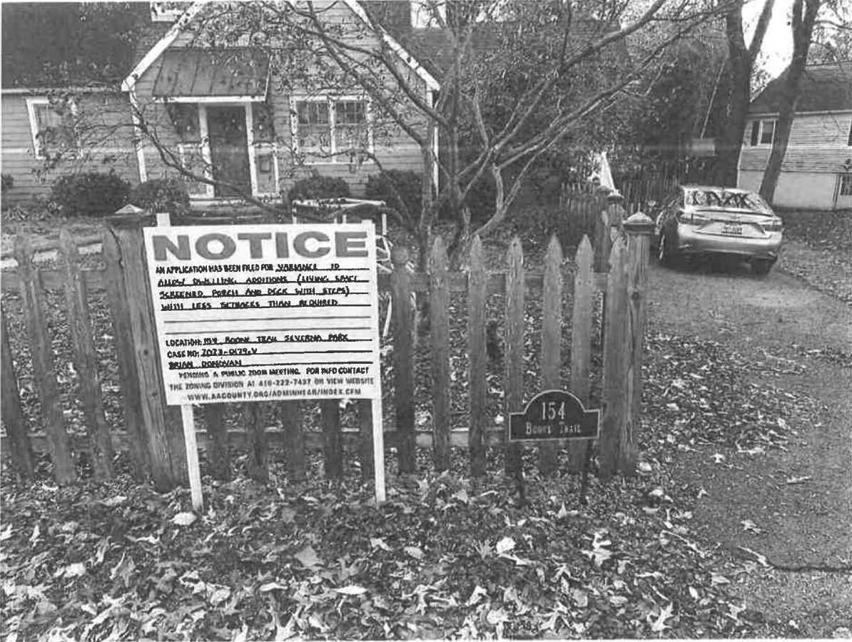
154 Boone Trail. Case # 2023-0179-V 11/28/23