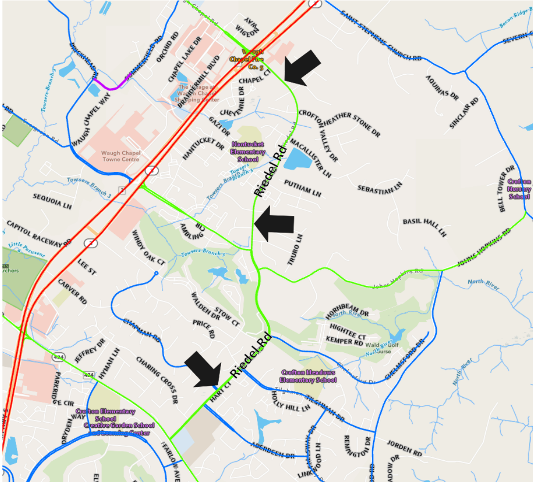
Map of Riedel Rd and surrounding area