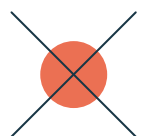
JOINT PAIN & INFLAMMATION