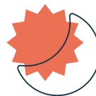
INSOMNIA & SLEEPLESSNESS