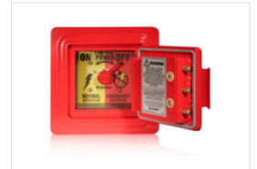
Remote Power Box