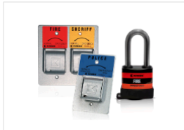
Gate Key Switches and Padlocks