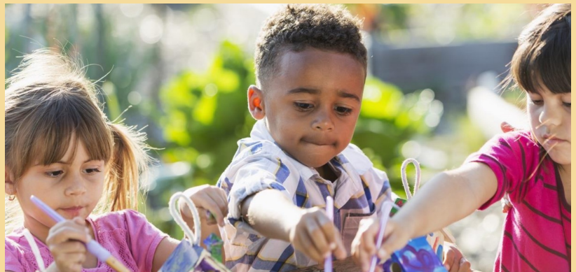
Creating A Common Agenda for Childcare – Statewide Child Care Summit September 10, 2024