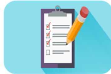
Make a Plan