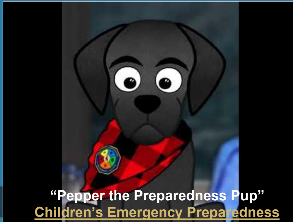
“Pepper the Preparedness Pup” Children’s Emergency Preparedness