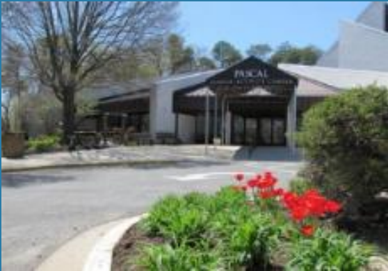
SENIOR ACTIVITY CENTERS