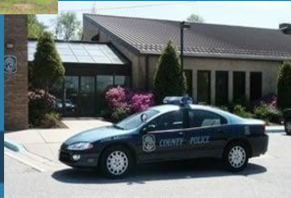
DISTRICT POLICE STATIONS

Need Shelter? Crisis Warmline 410-768-5522