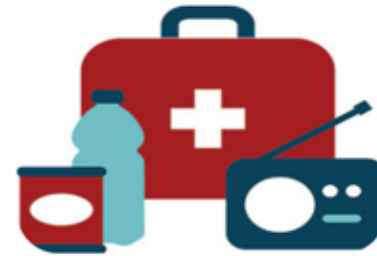
Build a Kit