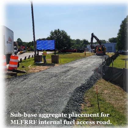
Sub-base aggregate placement for MLFRRF internal fuel access road.

The tasks currently underway are as follows: