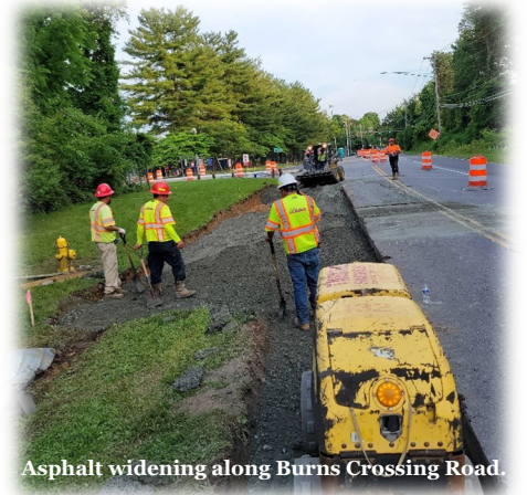
Asphalt widening along Burns Crossing Road.

As highlighted in previous newsletter articles, the Millersville Landfill and Resource Recovery Facility’s three entrances along Burns Crossing Road are being upgraded to improve vehicle access and routing, and enhance safety. The three entrances provide access to the Administration Building, County Landfill, and the Central Recycling Center. Construction began in early May 2024 and is expected to be finished by the end of 2024.