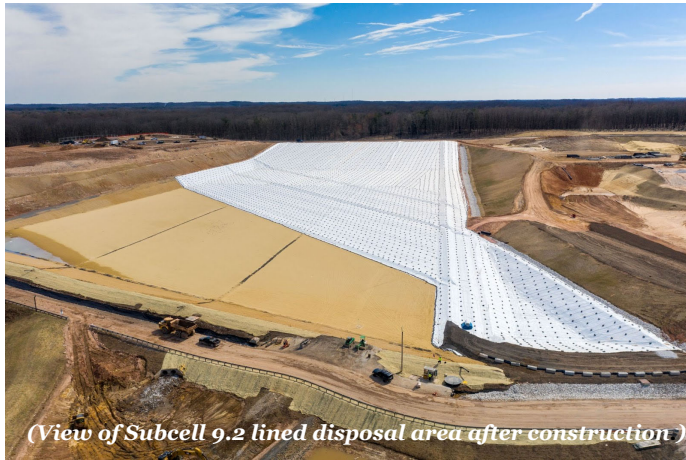
(View of Subcell 9.2 lined disposal area after construction)

In a previous newsletter (July-September 2023 edition), we included an article concerning the County's intent to seek approval from the Maryland Department of the Environment (MDE) to increase permitted disposal capacity within the Cell 9 disposal area. This initiative is consistent with the policies identified in the County's General Development Plan (Plan2040), which includes,